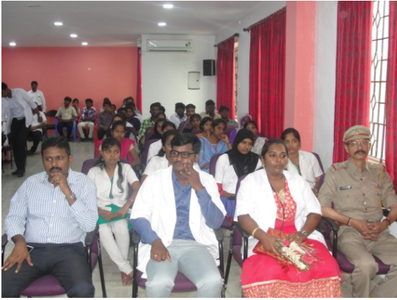
The Staff and students gathered for the guest speech