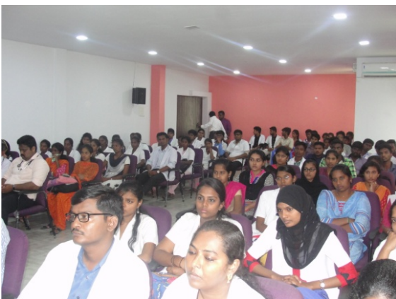
The programme winded up with vote of thanks and National Anthem