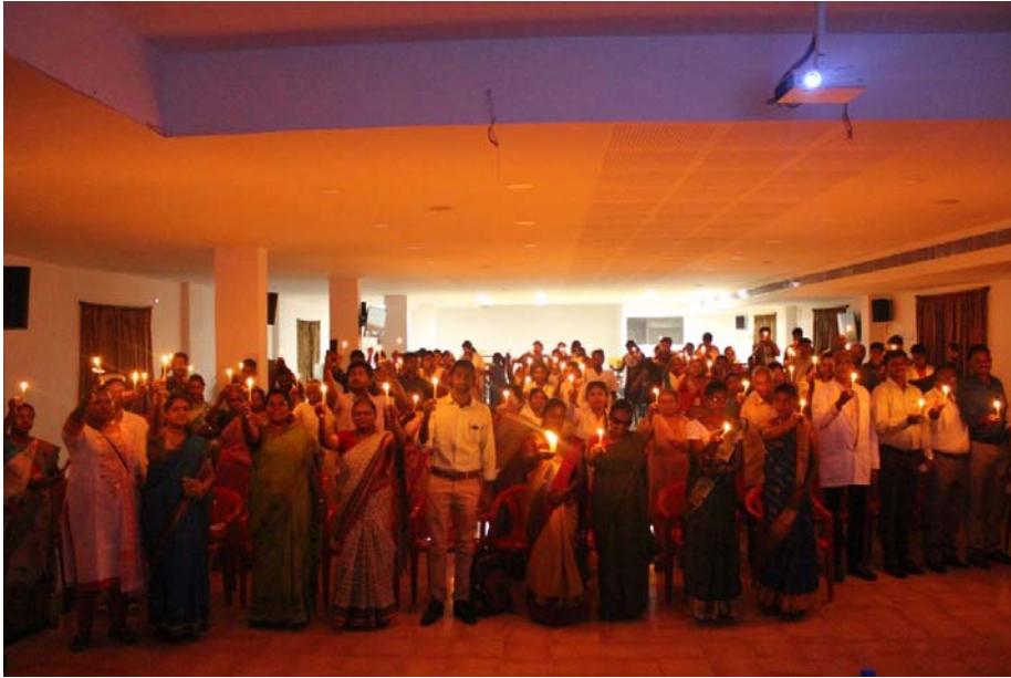
Candle lightning – For supporting suicide prevention, remembering a lost loved one and for the survivors of suicide