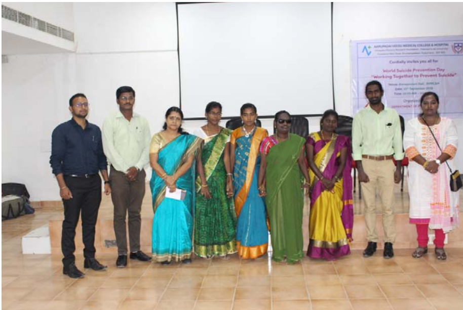
Coordinating Team- Working together to prevent suicide, WSPD-2018