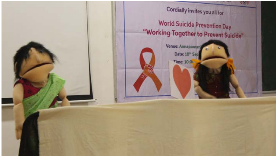
Puppet show - ThannambikkaiKalaiKuzhu