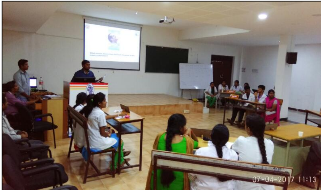
Figure 3: Quiz Master and Teams