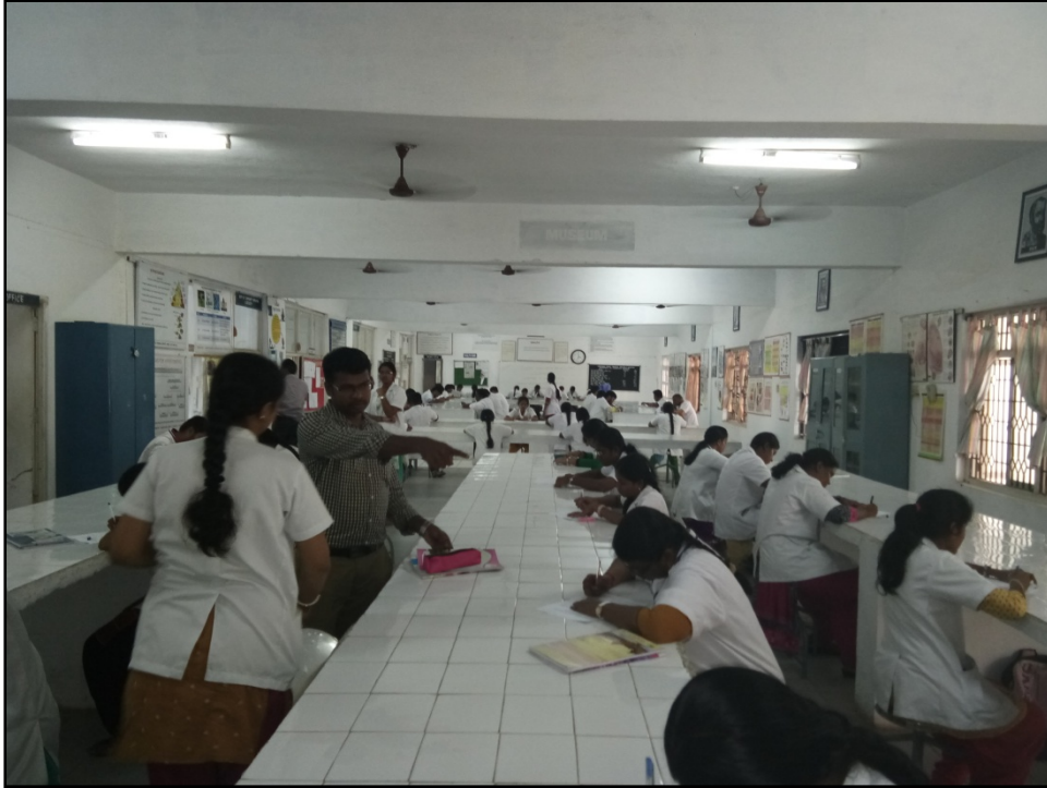
Figure 1: Preliminary round